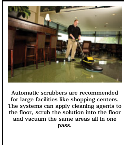
Automatic scrubbers are recommended for large facilities like shopping centers. The systems can apply cleaning agents to the floor, scrub the solution into the floor and vacuum the same areas all in one pass.

The tests will be conducted independently by third-party certifiers such as NFSI. At this time, the entire testing and certification procedure is voluntary; however, a few major home improvement centers indicate they will now require this labeling on cleaning products and finishes used for floor care. It is expected that as more end users and the general public become aware of these new standards and certification system, more facility managers and cleaning professionals will want to make sure their floors and floor care products have either a green or at least a yellow rating.