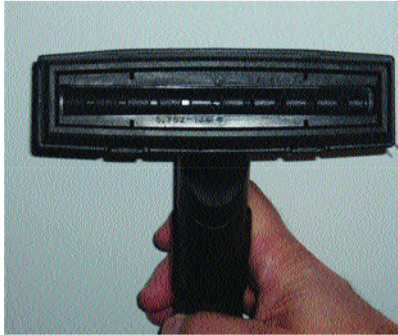
Tools with multiple steam ports provide even coverage.