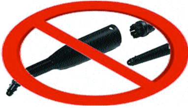
Single spray jets can fling bed bugs from the surface without killing them