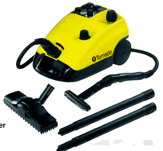
Tornado's DE 4002 Steam Cleaner

Use of a HEPA Vacuum and Tornado DE 4002 Steamer can dramatically lower the amount of pesticide needed.