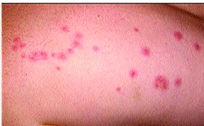
Bed bug bite

The problem we have today is that although there are now less-toxic pesticides available, they have proved to be far less effective in killing bedbugs. It is also quite difficult to get new pesticides approved by the federal government, particularly any pesticide that could come in direct contact with humans. Fortunately, there are options that are proving to be both effective and safer for the user and the environment. One is the use of professional steam cleaners.