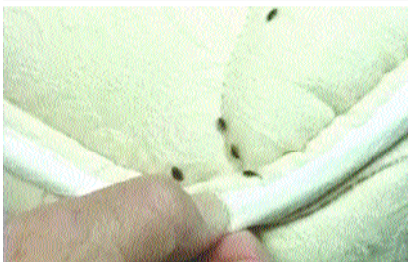
Signs of active infestations